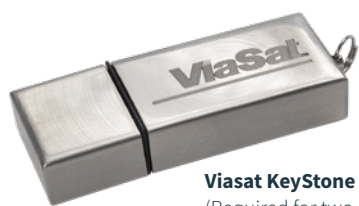
Viasat KeyStone (Required for two-factor authentication)